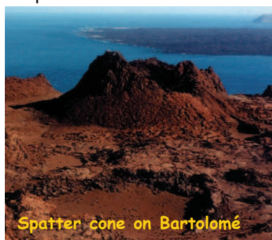
Spatter cone on Bartolomé

Thursday 2 October (B,D) We set off on a leisurely walk through an endemic Opuntia cactus forest to the nicest beach in Santa Cruz - Tortuga Bay. It's a surfing beach so wear your bathers for a dunk in the Galápagos waves. You'll see lava lizards, finches and you get to share the beach with marine iguanas, pelicans and blue-footed boobies. A free afternoon to ride, explore, shop or relax before dinner.