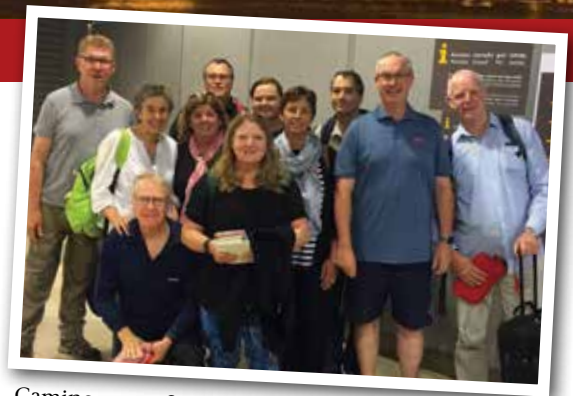
Camino group 2016