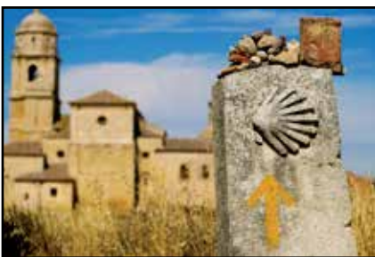
The scallop (symbol of St James) on the Camino Walk