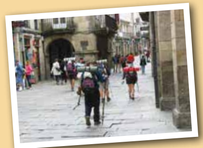
Camino Pilgrimage - Santiago de Compostela

Make your booking today via the contact details below.